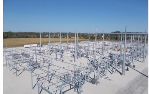
The new Meyer Substation