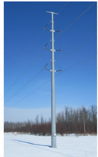
The new Summerton - Bullock 138 kV monopoles are similar to the one shown here.