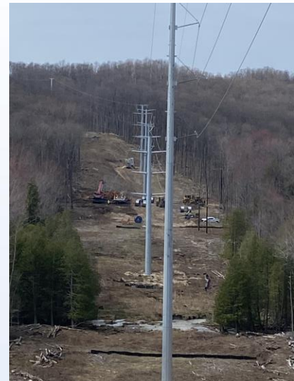
New Stover – Van Tyle Structures