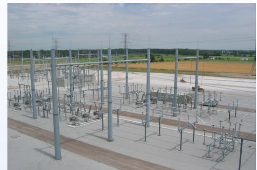
The new Blendon substation is similar to the one shown here.