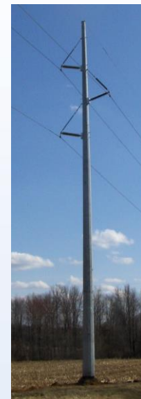
The new Battle Creek-Island Road poles will be similar to the one shown here.