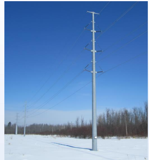
The new Amber – Donaldson Creek poles will be similar to the one shown here.